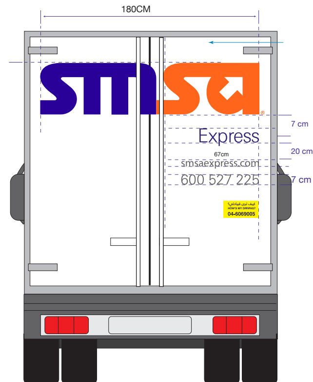
Decal Placement rear Side