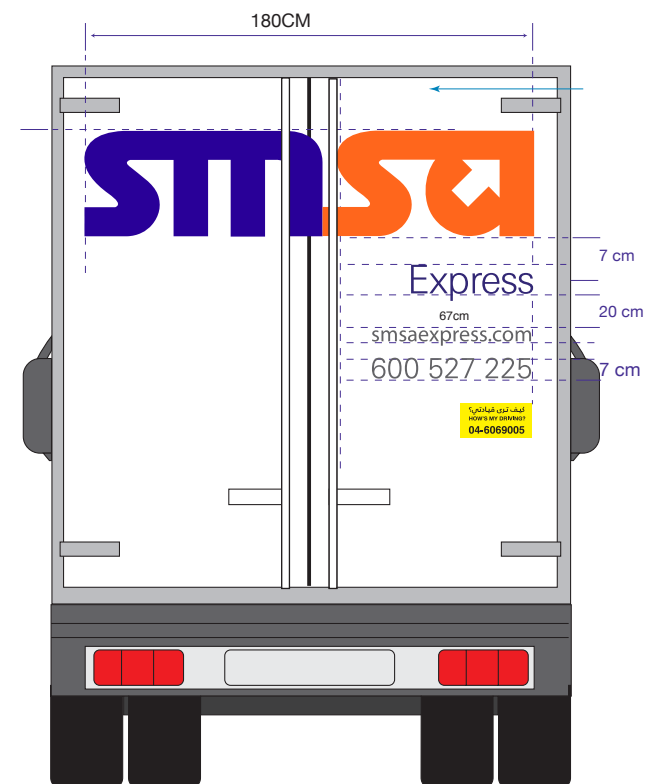
Decal Placement rear Side