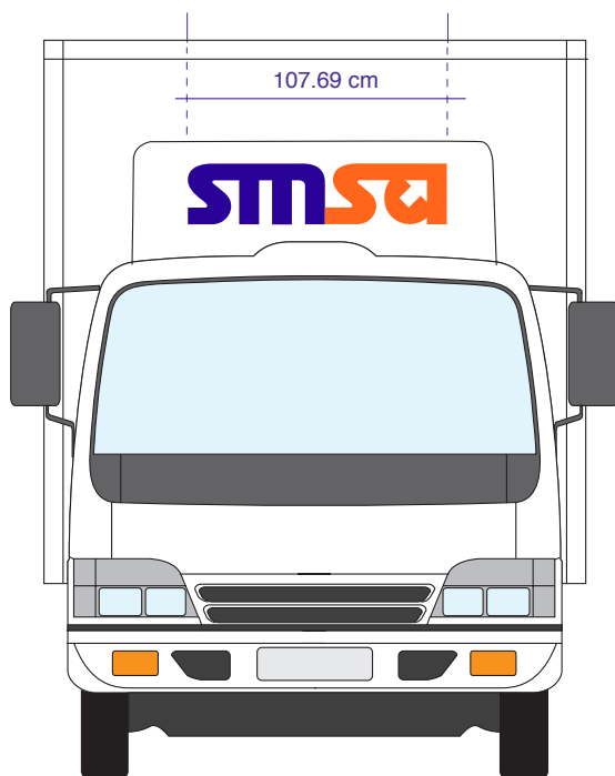
Decal Placement front Side